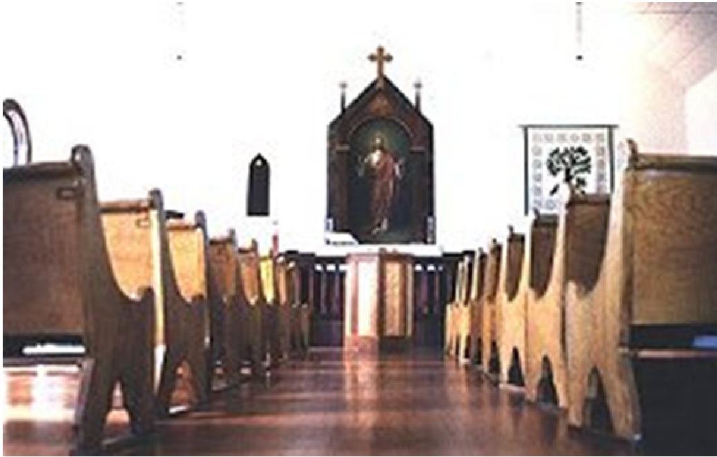
Inside the Church Sanctuary.