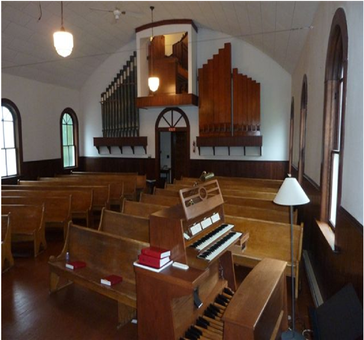
Organ Console & Pipe Loft

A beautiful pipe organ was installed last year by Heustis Pipe Organ Services of Ladner. It was originally built in the 1950s by the Schlicker organ company of Buffalo, New York for the chapel at Duke University in Durham, North Carolina. Subsequently, it was acquired and restored by the Rauh family of Richland, Washington; after many years of use by their two sons, it was purchased by the church last year and transported to Point Roberts by members of the congregation. Both the organ and piano accompany the services together with other instruments from time to time including flute, oboe, violin and drums.